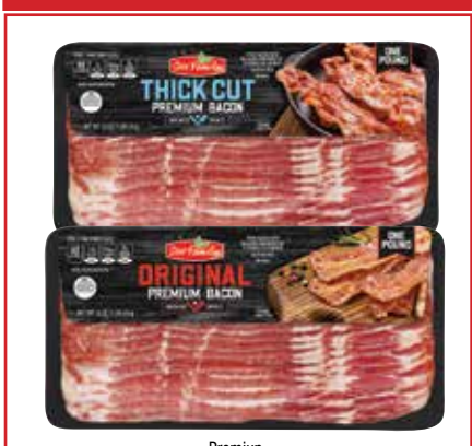
Premium Our Family