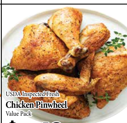
USDA Inspected Fresh Chicken Pinwheel Value Pack