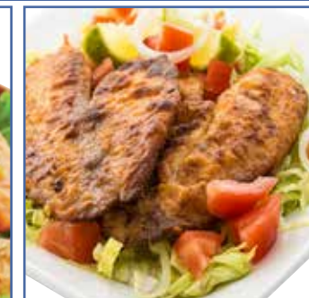
Fresh Frozen Swai Fillets