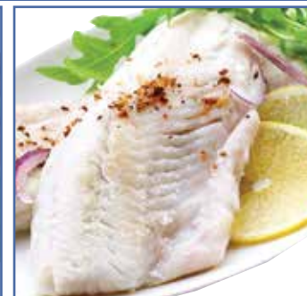
Fresh Frozen Ocean Perch Fillets