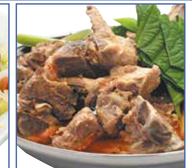
Fresh Pork Neck Bones Value Pack