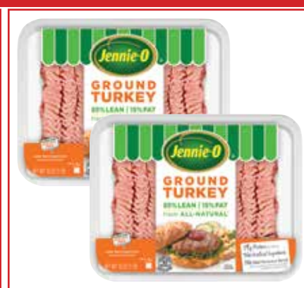
Jennie-O 85% Lean Ground Turkey 16 oz.