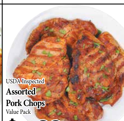
USDA Inspected Assorted Pork Chops Value Pack