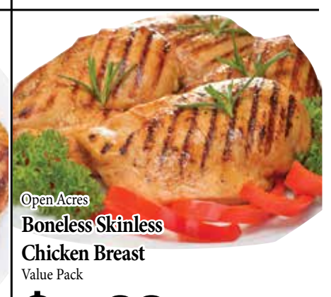
Open Acres Boneless Skinless Chicken Breast Value Pack