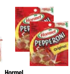
Hormel Sliced Pepperoni 5 - 6 oz.