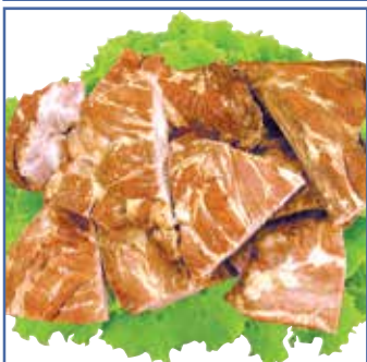
Smoked Pork Neck Bones Value Pack