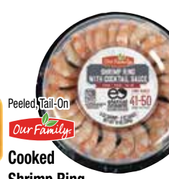
Peeled, Tail-On Our Family Cooked Shrimp Ring with Cocktail Sauce 10 oz.