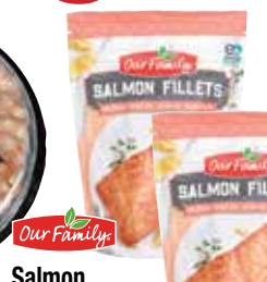
Our Family Salmon Fillets 16 oz.