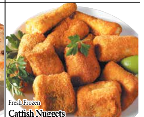
Fresh Frozen Catfish Nuggets