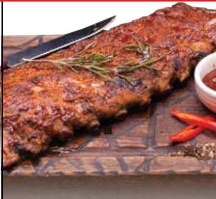
USDA Inspected XXX Pork Spareribs