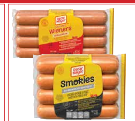
Oscar Mayer Meat Franks Select Varieties 16 oz. (excludes beef and turkey)