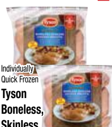
Individually Quick Frozen Tyson Boneless, Skinless Chicken Breast 2.5 lb.