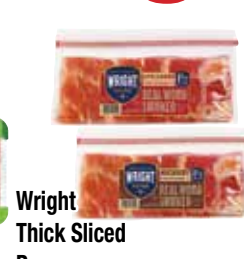
Wright Thick Sliced Bacon Select Varieties 24 oz.