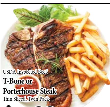
USDA Inspected Beef T-Bone or Porterhouse Steak Thin Sliced, Twin Pack