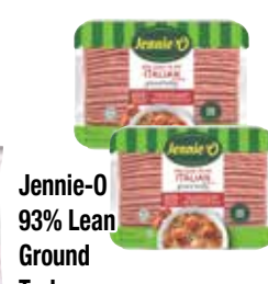
Jennie-O 93% Lean Ground Turkey Select Varieties 16 oz.