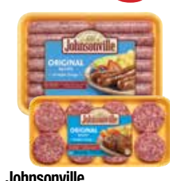
Johnsonville Breakfast Sausage Links or Patties 12 oz.