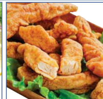
USDA Inspected Fresh Boneless Chicken Tenders