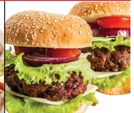
USDA Inspected Fresh Ground Chuck Beef Patties Value Pack