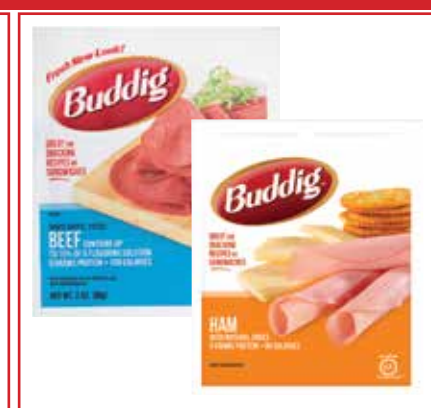
Buddig Thin Sliced Lunch Meat Select Varieties 2 oz.