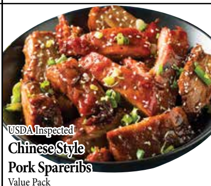
USDA Inspected Chinese Style Pork Spareribs Value Pack