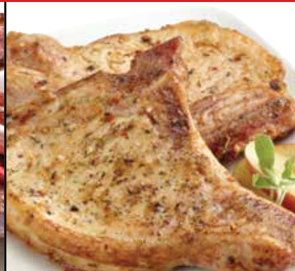
USDA Inspected Center Cut Pork Chops Reg. Cut Value Pack