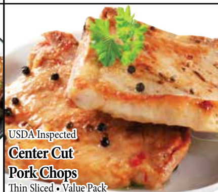
USDA Inspected Center Cut Pork Chops Thin Sliced • Value Pack