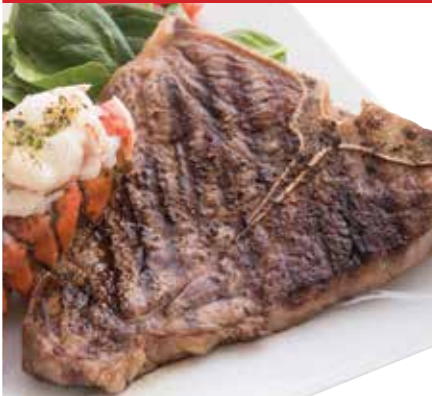
USDA Inspected Beef T-Bone or Porterhouse Steak Thin Sliced • Value Pack